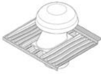
HV160 Shake & Royal